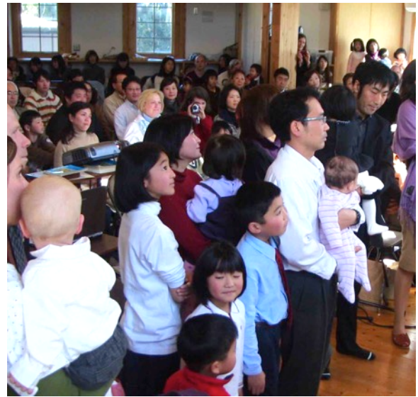
Adult and covenant children baptisms at OCC

We came to Japan to give the gospel to the Japanese. By grace God has also shown us more and more of our own sin, and how much WE need The Gospel!